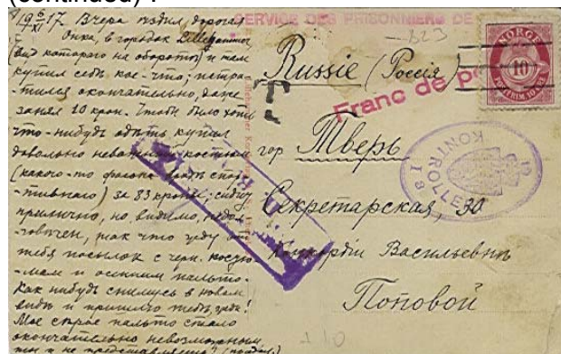
Fig. 3: Postcard depicting Lillehammer, postmarked in Kristiania and sent via Petrograd to Tver; franked with 10 Øre

The next postcard from the same interned POW of the Ring camp (Fig. 3) is machine cancelled at an unknown place (Kristiania again?). The Norwegian and Russian censorship is similar to that on the postcard in figure 2. It was also sent to Tver where it arrived at 11. December 1917 (Russian calendar). It has a cancel "Service des prisonniers de guerre" and "Franc de port". In spite of this it bears a 10 Øre stamp. The text says in Russian: "6.XI.1917 Yesterday I travelled, dear Onka, to the (small) town of Lillehammer (as you can see on the other side) and there I bought something; used all my money, even though I borrowed 10 Kroner. So that I had here something (with me) I bought a not to bad dress (like a sport dress) for 83 Kroner, (it) fitted well, but it looks like I will not use it for very long, so that (I) wait for a package from you, with a dark dress and autumn coat. In one way or another (I will be) photographed in the suit and send you the picture, wait (for the picture)! My old coat became useless, you may not believe it! (continued)".