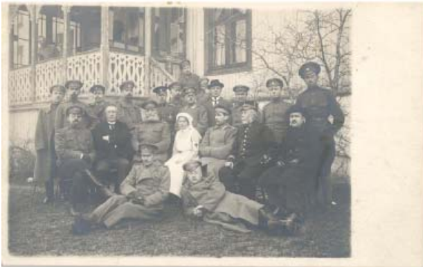
Fig. 6: Picture postcard depicting the interned POWs in front of the Ring Pension

Another interesting postcard has also turned up. It shows some of the Russian POWs that were interned at Ring (Fig. 6). You can easily see that the picture was taken in front of the building that is depicted in figure 2.