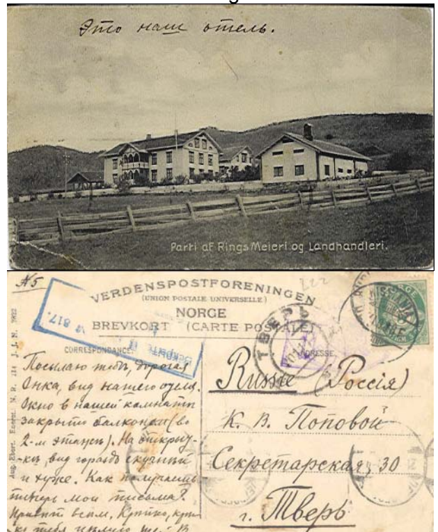
Fig. 2: Postcard depicting the Ring pension (Parti af Rings Meieri og Landhandleri), postmarked in Kristiania and sent via Petrograd to Tver; franked with 5 Øre

Ring is located approximately 2 km from Moelv. Until now there has been little information about Russian interned POWs. In John Thiesen's book [1] it is stated: "... a number of Russian semi-invalids was interned. There were no internees here on 2nd of July 1917, but in October there were again 35 Russians interned in Ring."