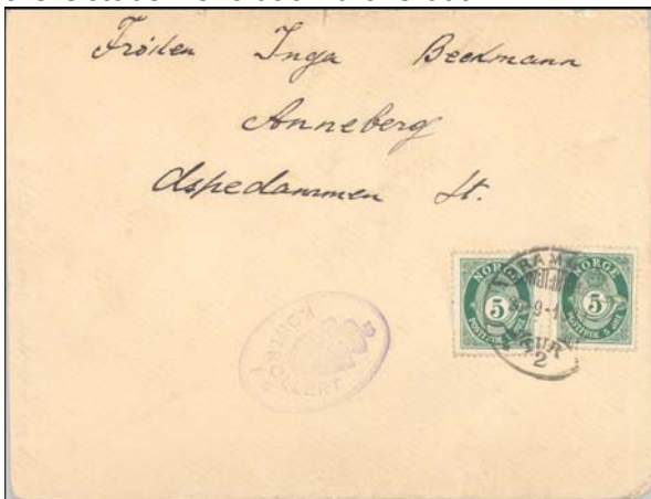
Fig. 1: Cover from Konnerudkollen to Aspedammen, postmarked 26.9.1917 in Drammen