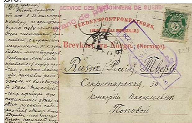
Fig. 4: Postcard postmarked with an illisible mark and sent via Kristiania and Petrograd to Tver; franked with 5 Øre

The text continues on the third card (Fig. 4) and reads: "6 XI 1917 (continuation) This (small) town is 25 km north of us; with the railroad it is almost a hour. Very clean, beautiful and good shops, because many tourists are here. I like very much the Norwegian girls (in private, most of them with small and beautiful mouths!). I'm afraid that I will fall in love here! Three English officers have already married here and a Russian shall also do it. My health is better. The weather is getting worse. Yours V.". Similar to card number 2, but this time franked with 5 Øre.