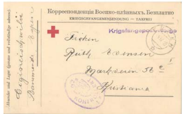
Fig. 7: POW formular postcard from Espen with censor cancel from Kristiania

Espen is located approximately 8 km from Strandlykja to the east of lake Mjøsa. In July 1917 73 semi-invalids were interned there [1,2]. Figure 7 shows the standard POW cards used on 4. April 1918 in Espen. It has a postage free cancel “Krigsfangepost, Norge” (meaning “Prisoners of war, Norway”), and an oval censor cancel used in Kristiania.